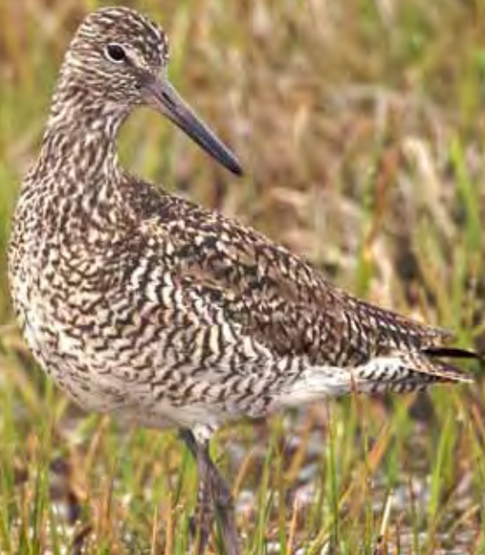
Teta'kumiki Willet - Tringa semipalmata