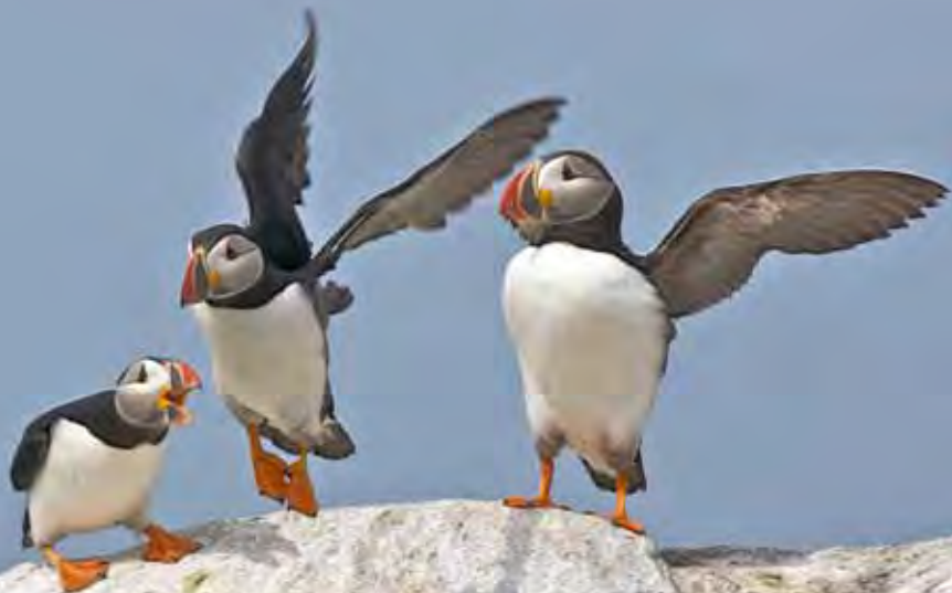
Keskeskunajit Atlantic Puffin Fratercula arctica