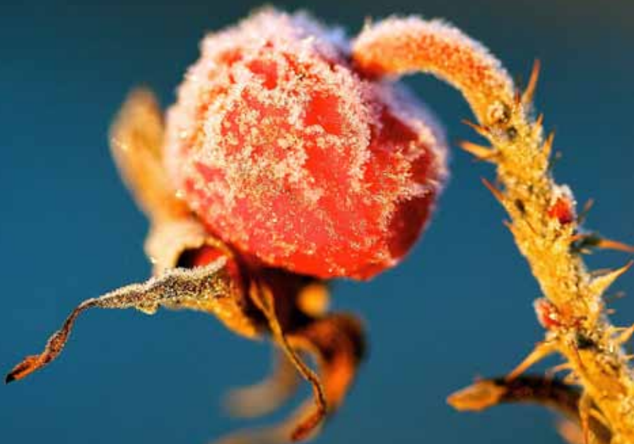
Kisi'paqa'luwejki Rosa virginiana