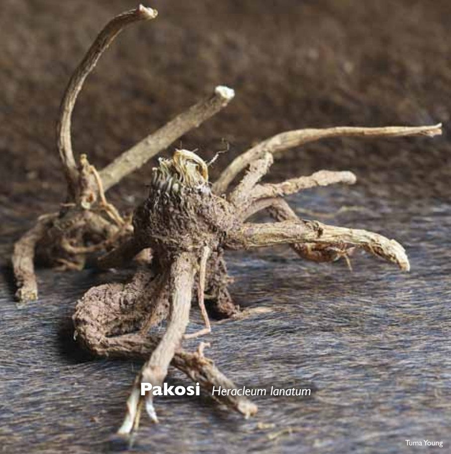
Pakosi Heracleum lanatum