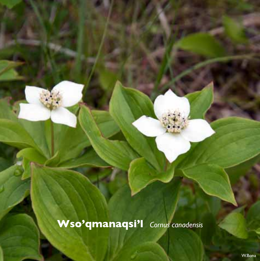
Wso'qmanaqsi'l Cornus canadensis