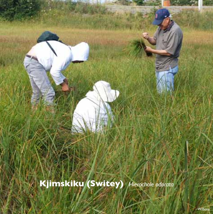
Kjimskiku (Switey) Hierochole odorata