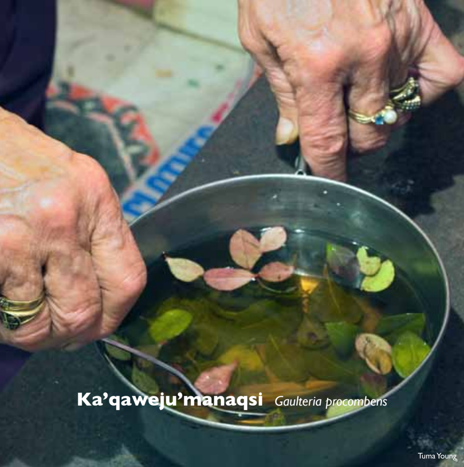
Ka'qawaju'manaqsi Gauleteria procombens