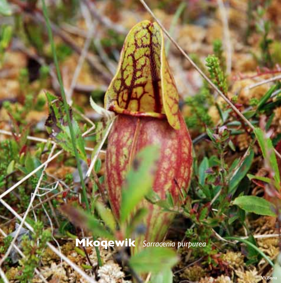
Mkoqewik Sarracenia purpurea