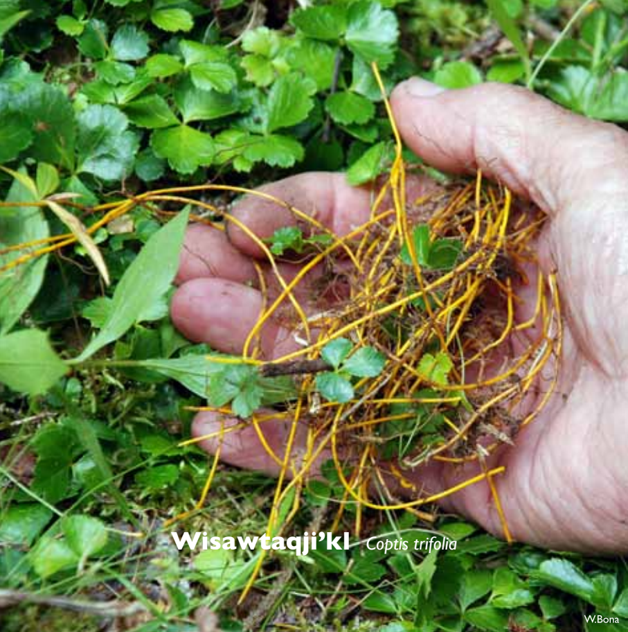
Wisawtaqji'kl Coptis trifolia