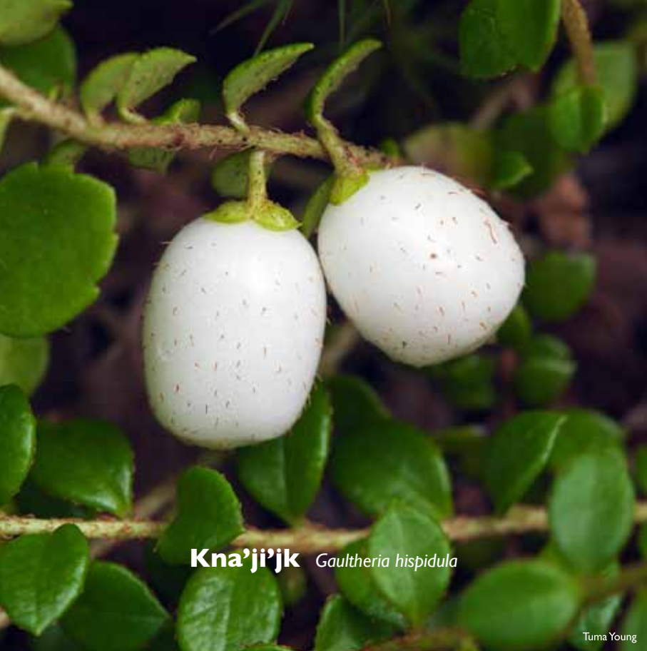
Kna'ji'jk Gaultheria hispidula