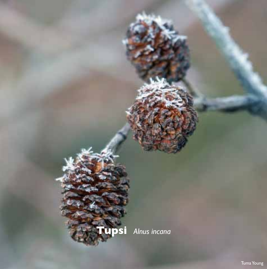
Tupsi Alnus incana