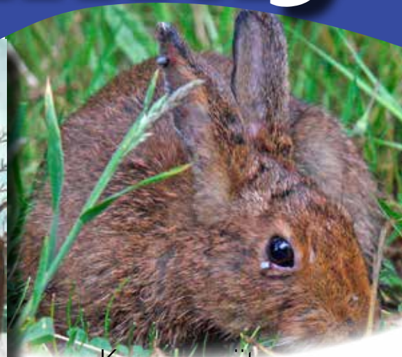
Koqoey wjit weji-ksalu'kik